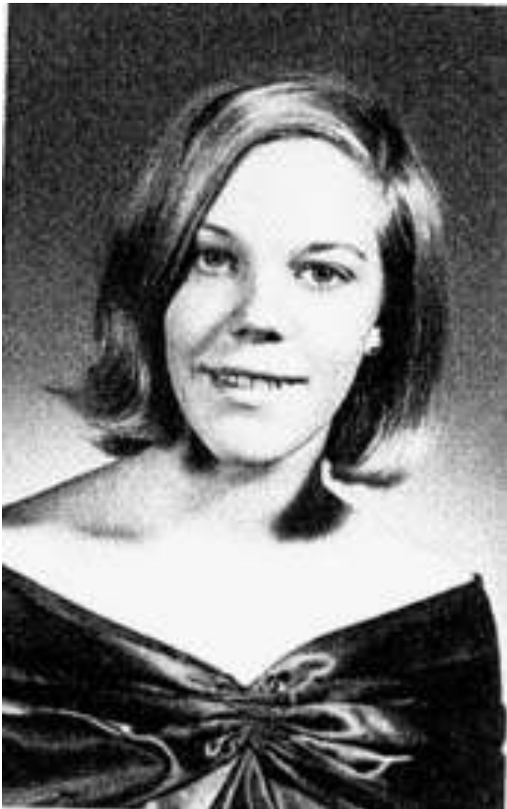
Class of 1969 High School Senior Class Photo