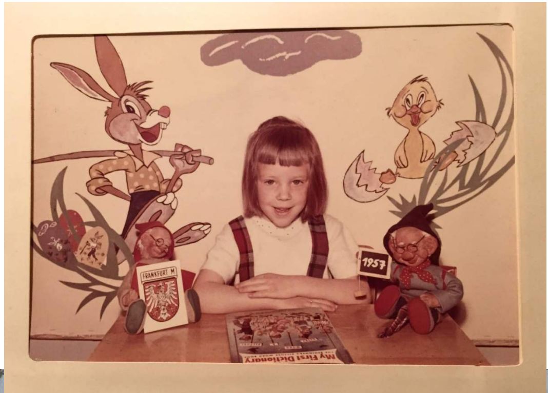
Grade School, 1957